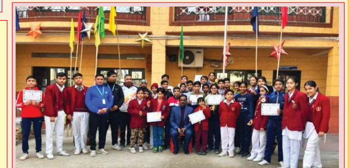
Winners of Badminton Competition 2022 (Neb Sarai)