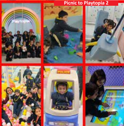
Picnic to Playtopia 2