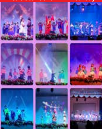
Retro 90s Ps and PP Annual day