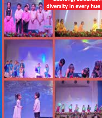
Sabrang; celebrating diversity in every hue 2