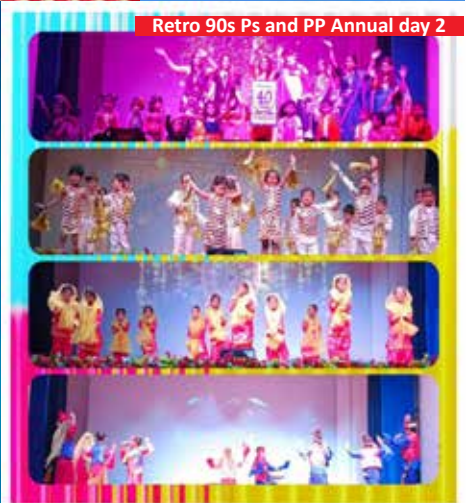
Retro 90s Ps and PP Annual day 2