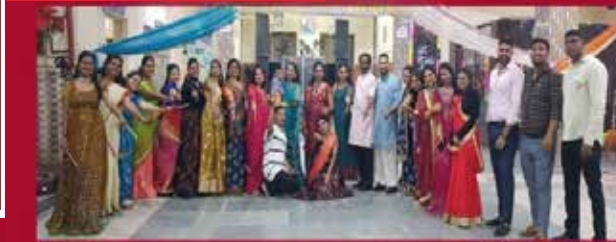
Dandiya Night 1