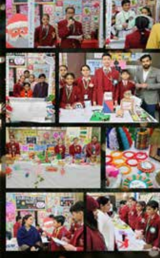
Display of Creativity