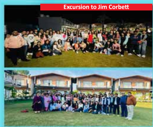
Excursion to Jim Corbett