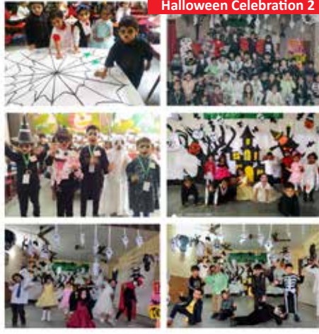
Halloween Celebration 2