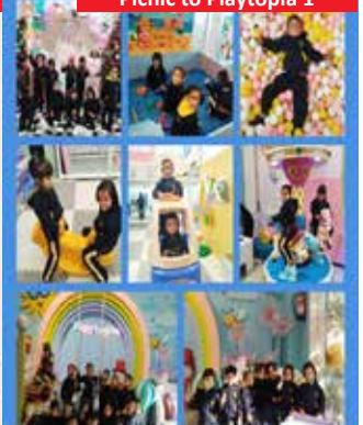
Picnic to Playtopia 1