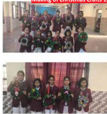
Making of Christmas Crafts 1