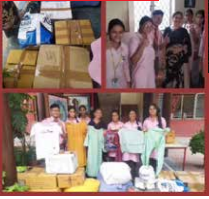
Cloth drive SF