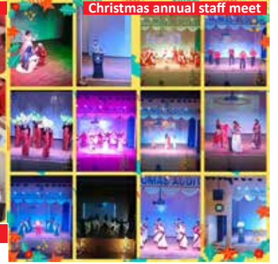
Christmas annual staff meet