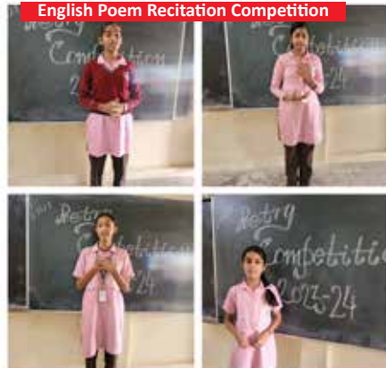
English Poem Recitation Competition