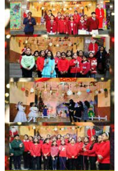
Christmas Special Assembly 2