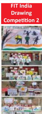
FIT India Drawing Competition 2