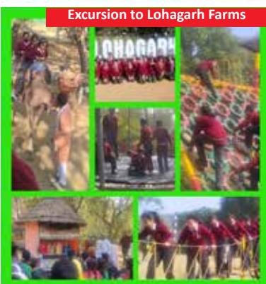
Excursion to Lohagarh Farms