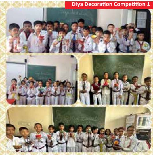
Diya Decoration Competition 1