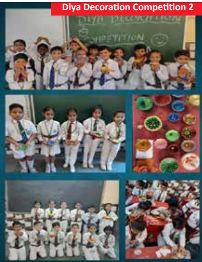
Diya Decoration Competition 2