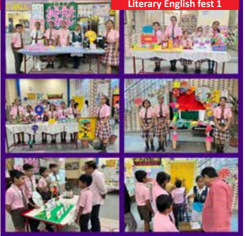
Literary English fest 1