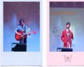
Christmas Special Assembly 1