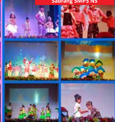
Sabrang SMPS NS