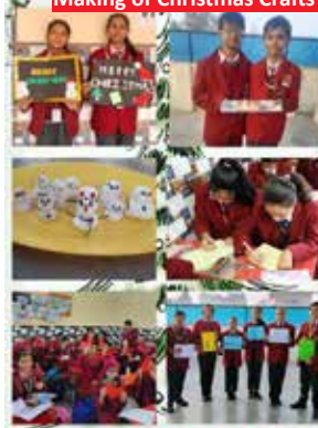
Making of Christmas Crafts 2