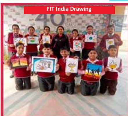
FIT India Drawing