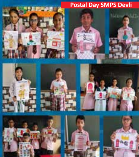
Postal Day SMPS Devli