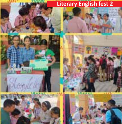
Literary English fest 2