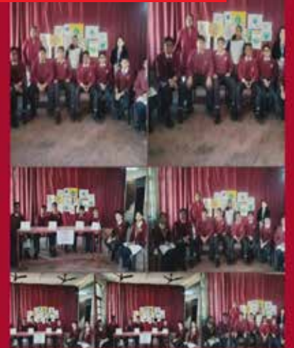
Debate on AIDS