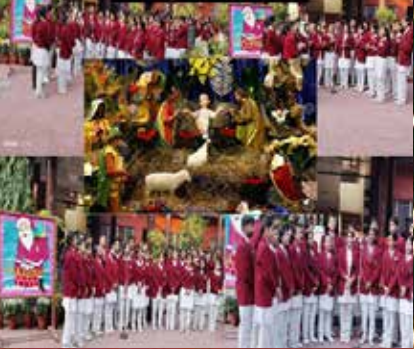
Christmas Special Assembly 3