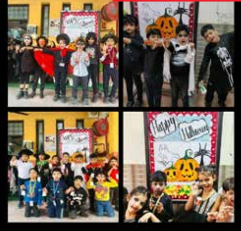
Halloween Celebration 1