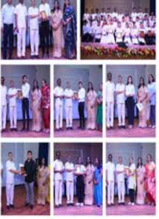
Award Ceremony of Batch 2022- 23