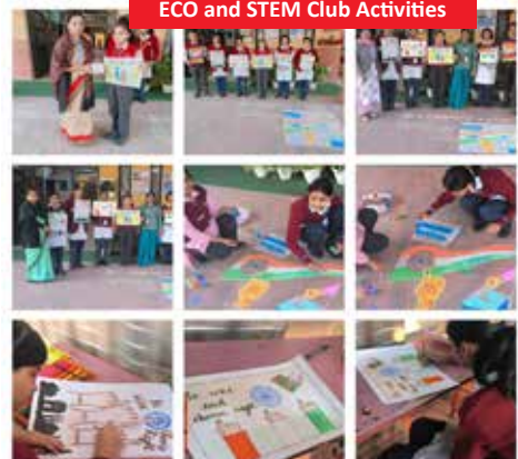
ECO and STEM Club Activities